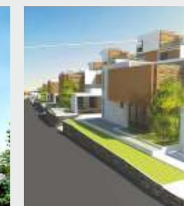
BUENA VISTA Vattiyoorkavu