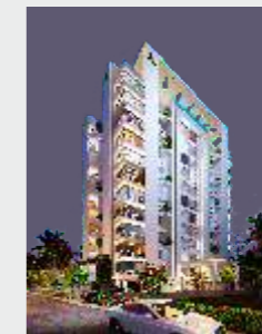
WINTER LEAF Vattiyoorkavu