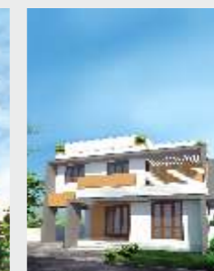
LAKE VIEW GARDENS Vattiyoorkavu