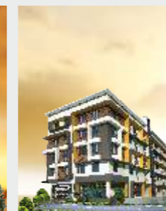
GREEN TERRACE PTP Nagar