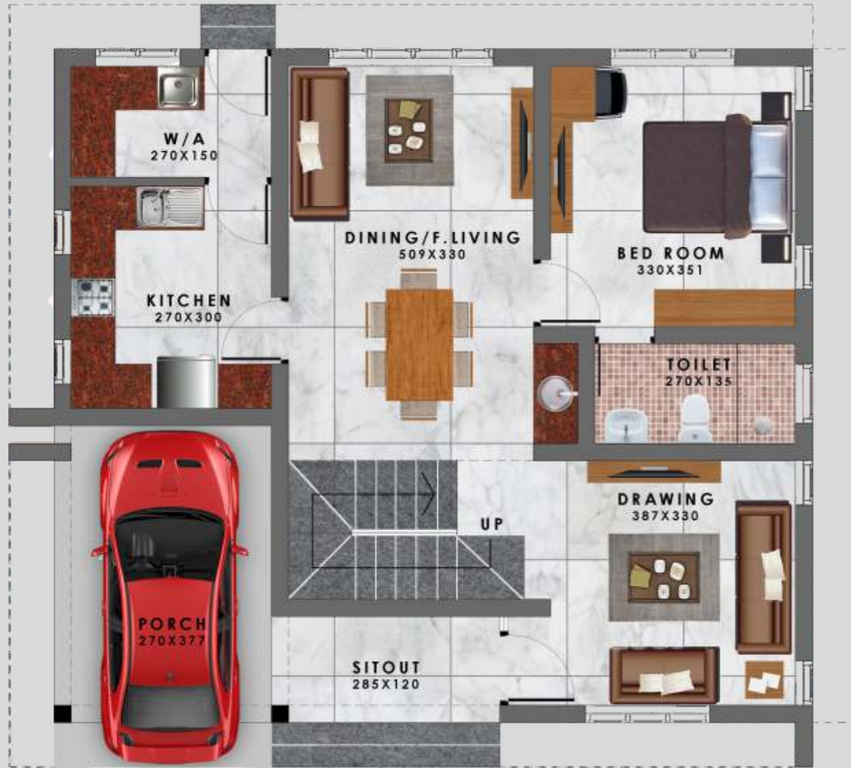
TYPE B GROUND FLOOR AREA - 1000 Sq. Ft.