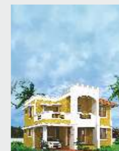
GREEN CASTLE Kudappanakunnu