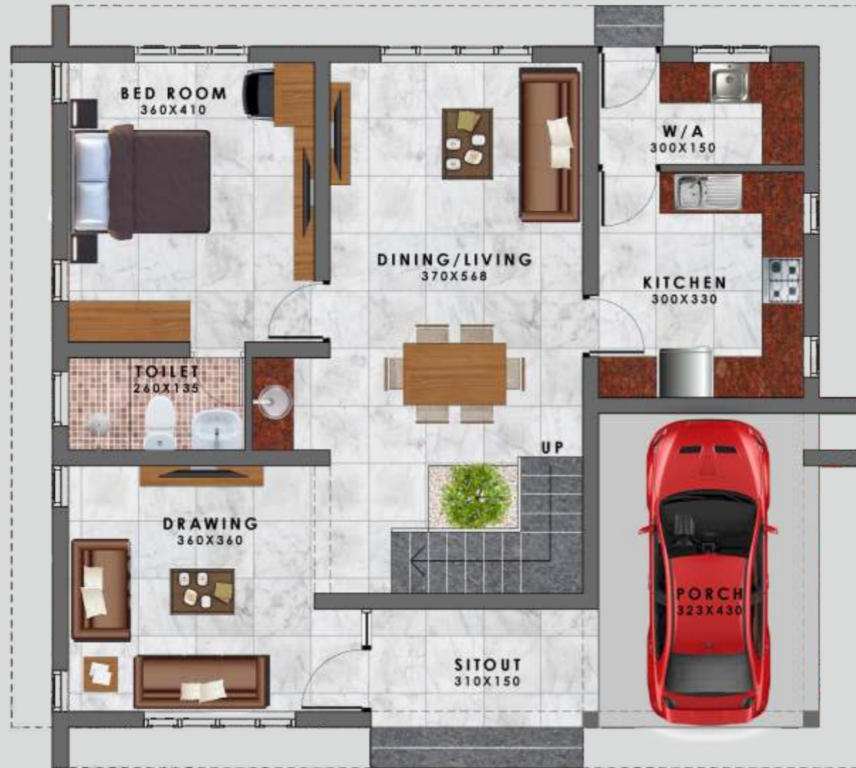
TYPE A1 GROUND FLOOR AREA - 1205 Sq. Ft.